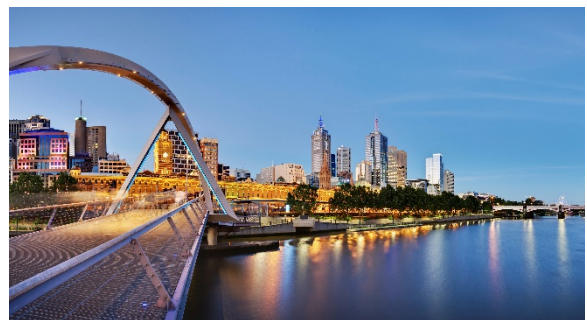
Sidney (top) and Melbourne (above)