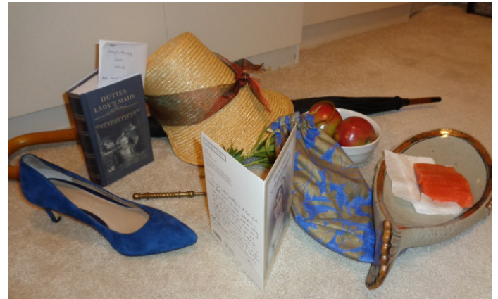
Some of the treasures Joan discovered in the Scavenger Hunt

winning contribution in front my computer. It was certainly a much better offering than the rather wilted bunch of cilantro someone offered from their fridge!