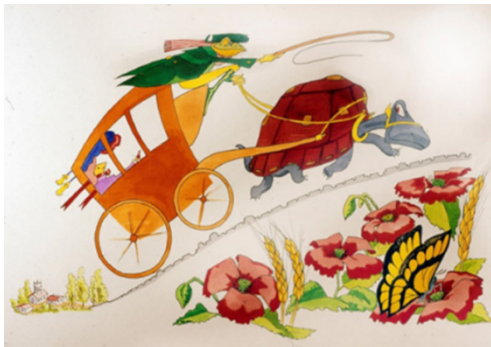
Illustration by Juliet McMaster from The Beautiful Cassandra , whose heroine is always on the move.

Behind all these “histories” which were really novels, was the notion that somehow histories are more dignified and high-class, and more sophisticated than a mere novel, considered to be lowbrow. In both the “Female Ramble” novels and those disguised as History, there were some characteristics (I will name just four out of the twelve characteristics named by the speaker: